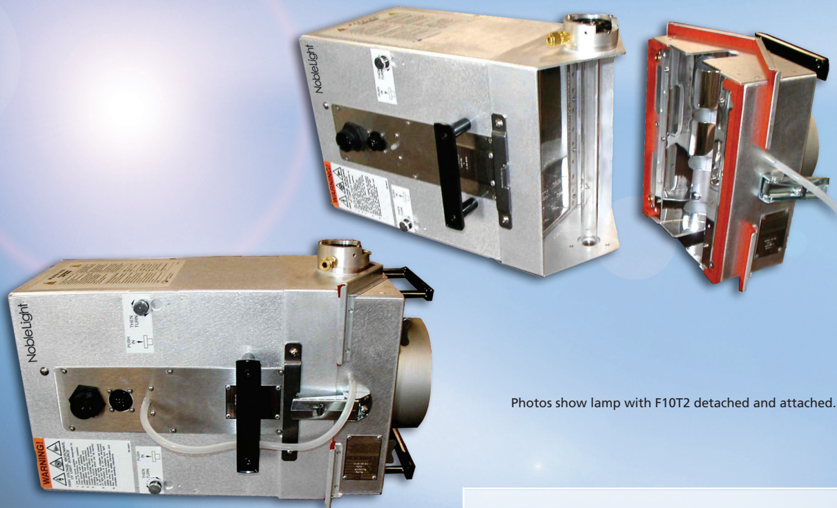
Photos show lamp with F10T2 detached and attached.